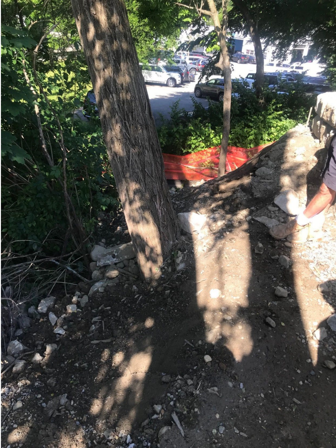
Tree is about 6 feet from retaining wall, roots and truck were buried in grading fill