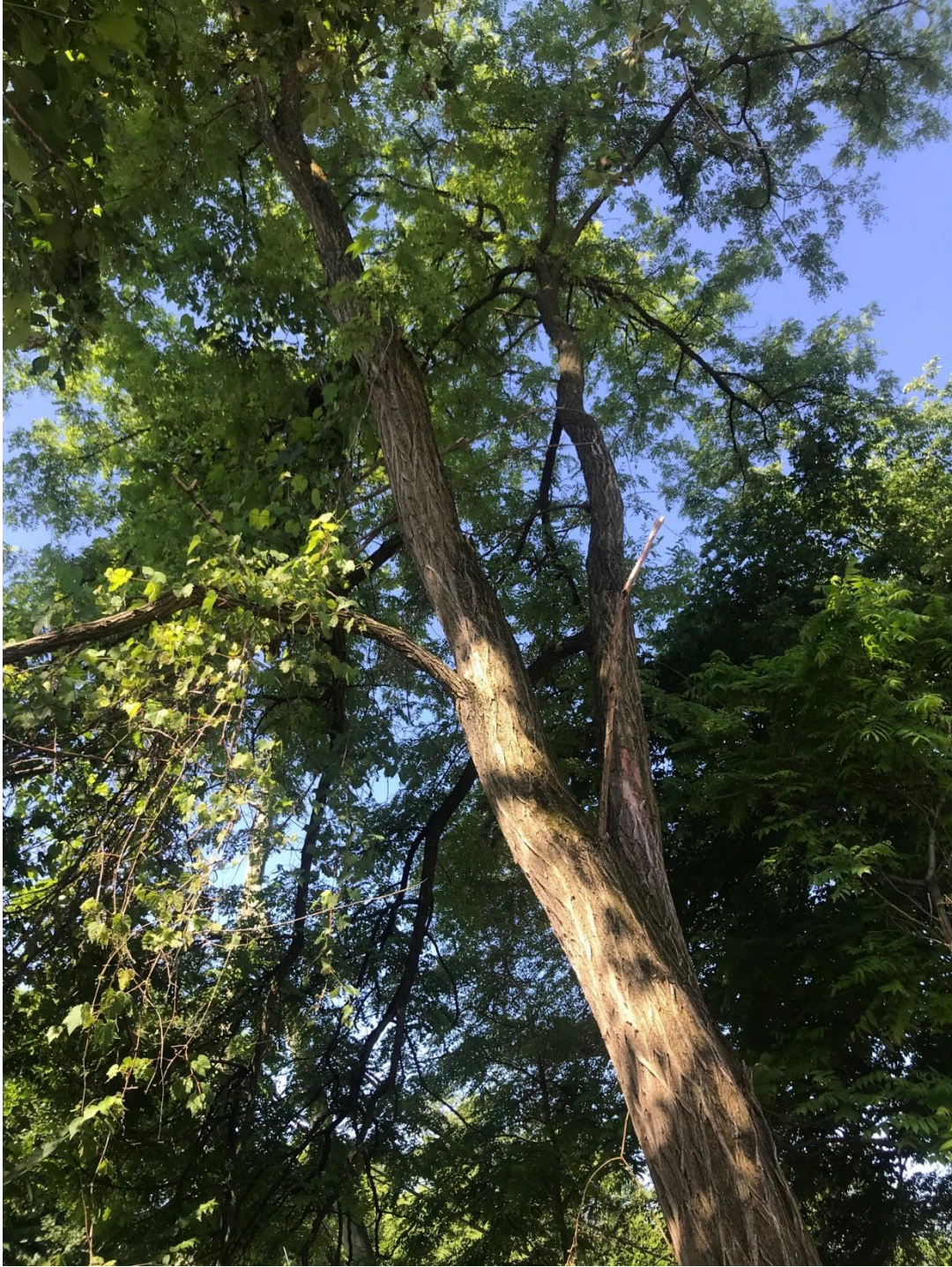
Canopy of tree