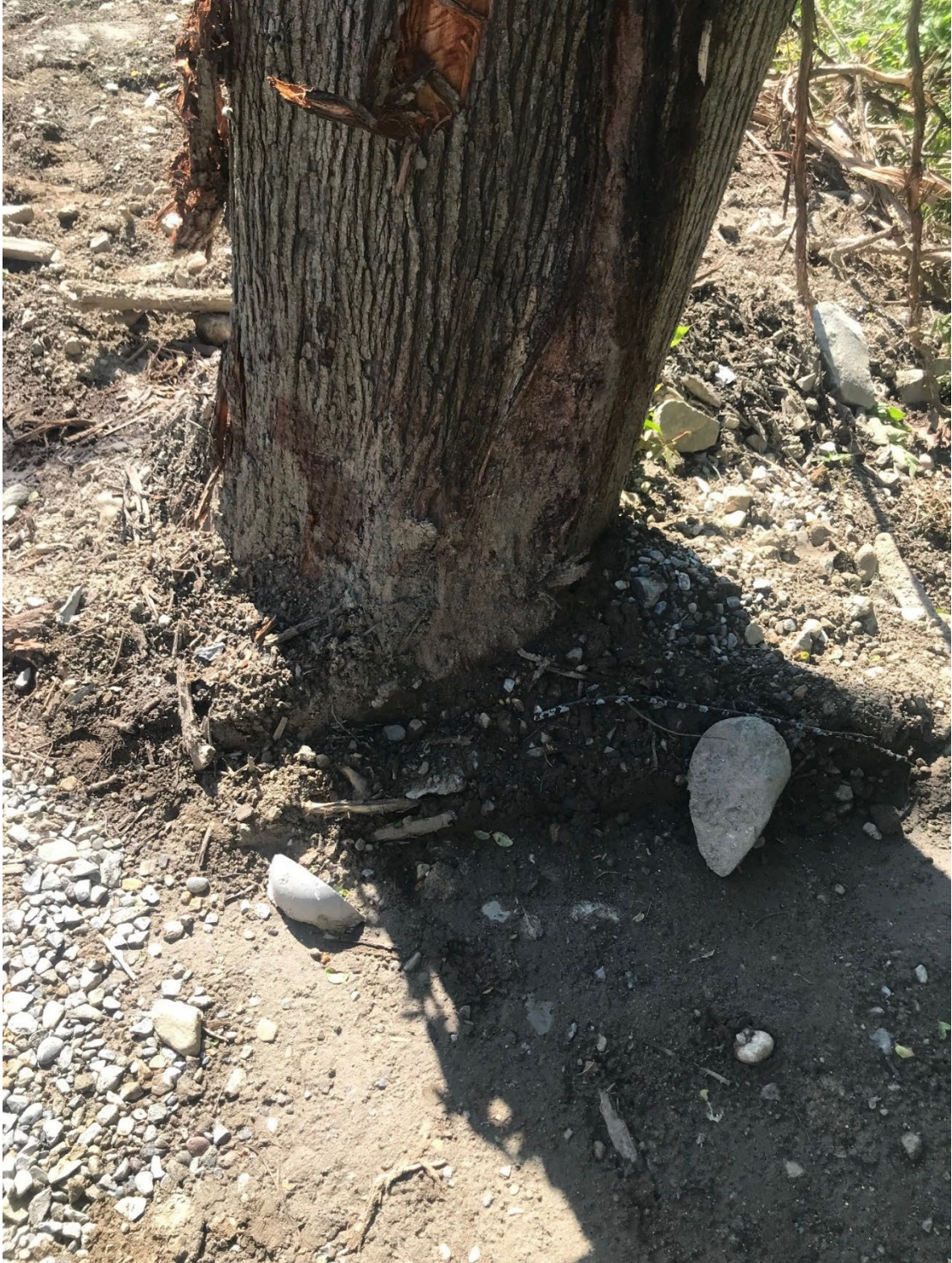
Trunk and root zone was damaged during construction of retaining wall