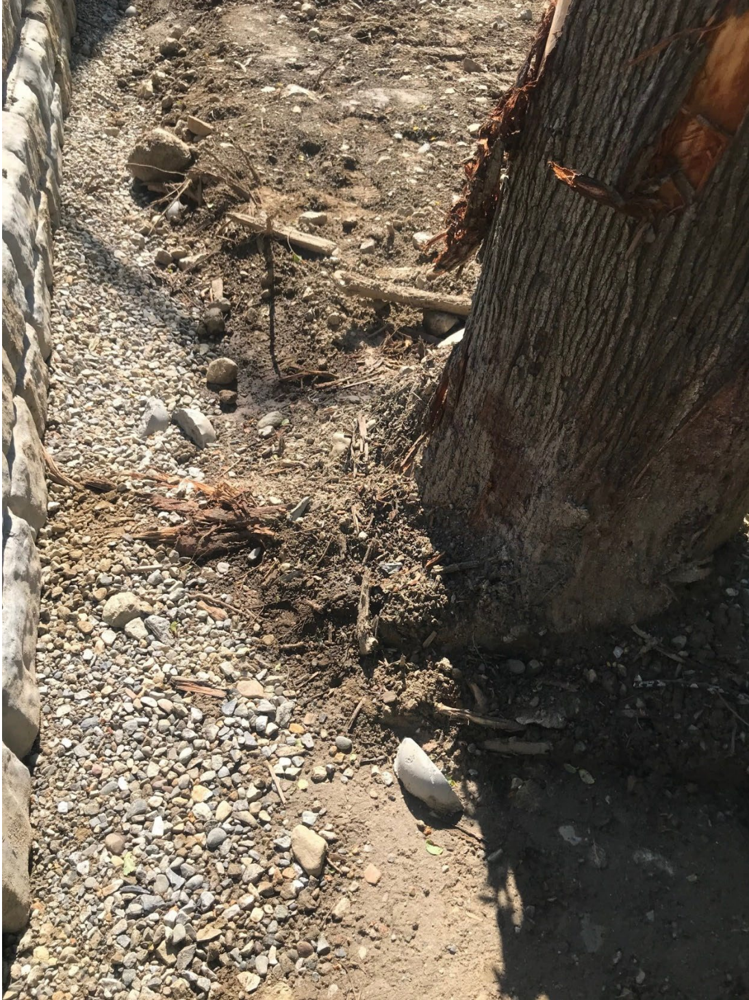
Large root was cut to allow retaining wall to be constructed