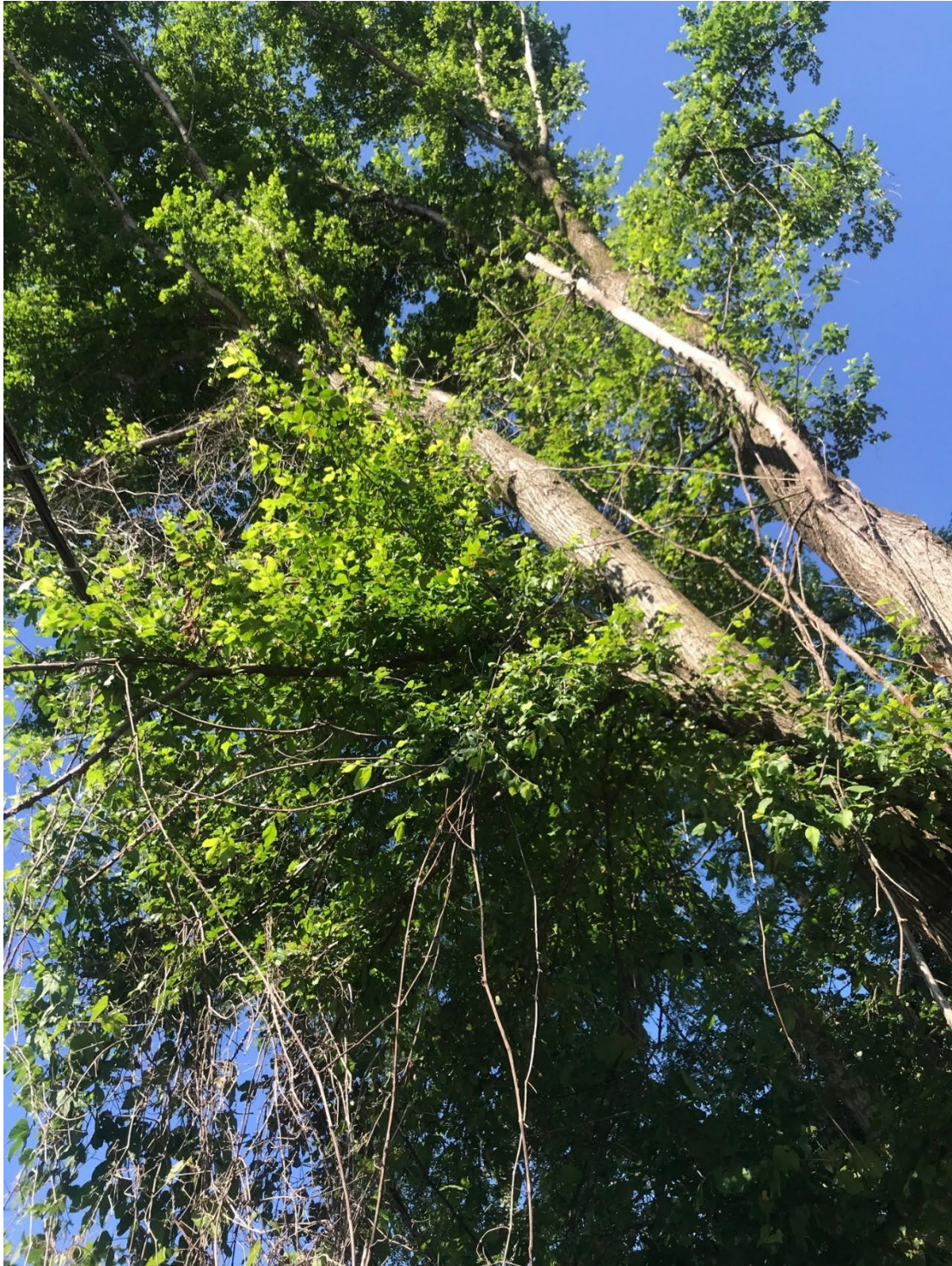
Canopy of tree, communication wire close to tree