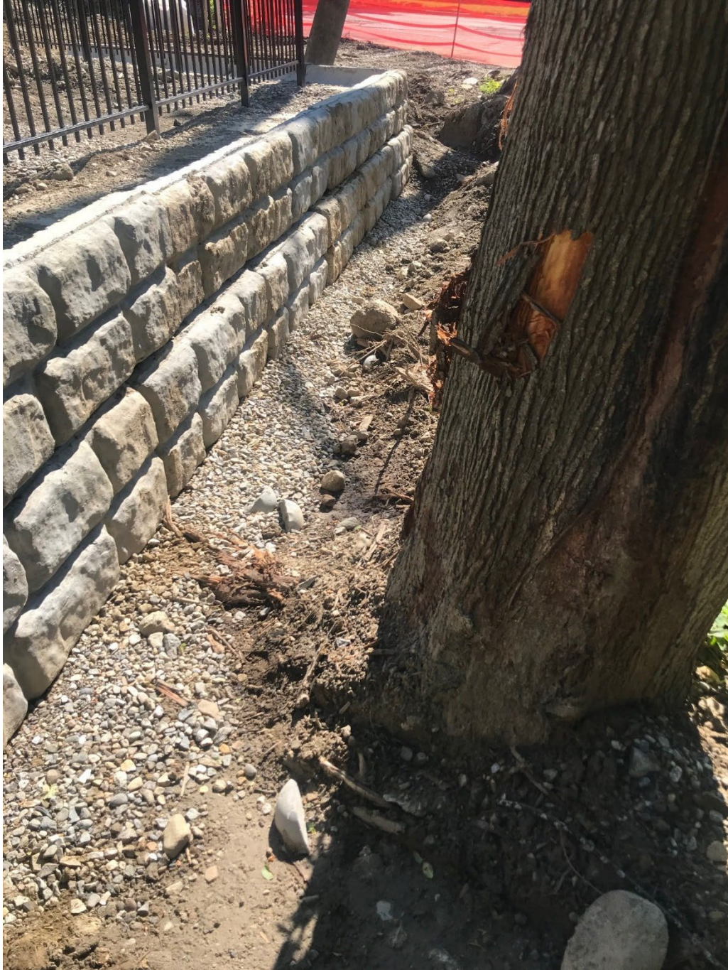
Tree is 2 feet from retaining wall.