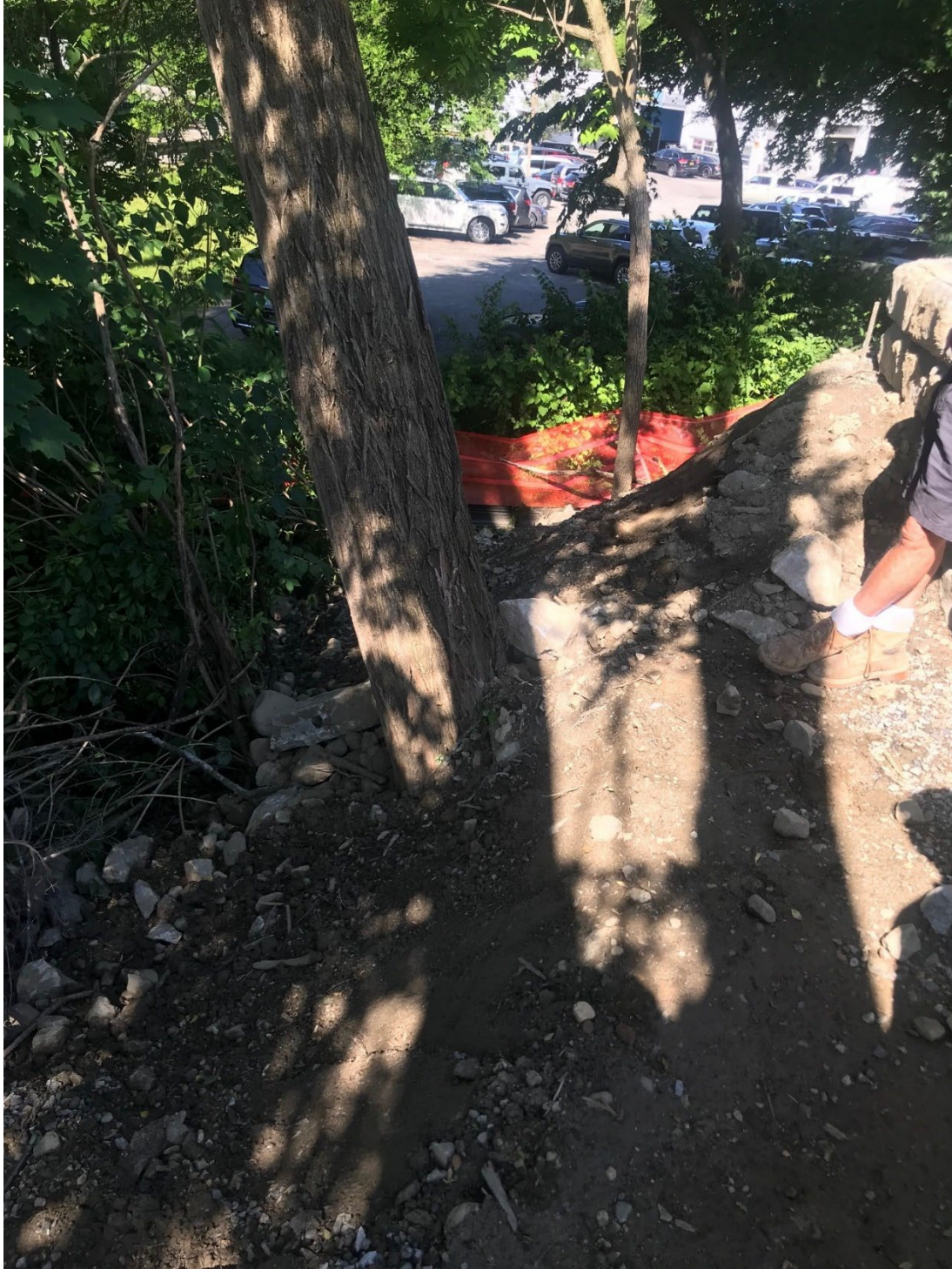
Tree is about 6 feet from retaining wall, roots and truck were buried in grading fill