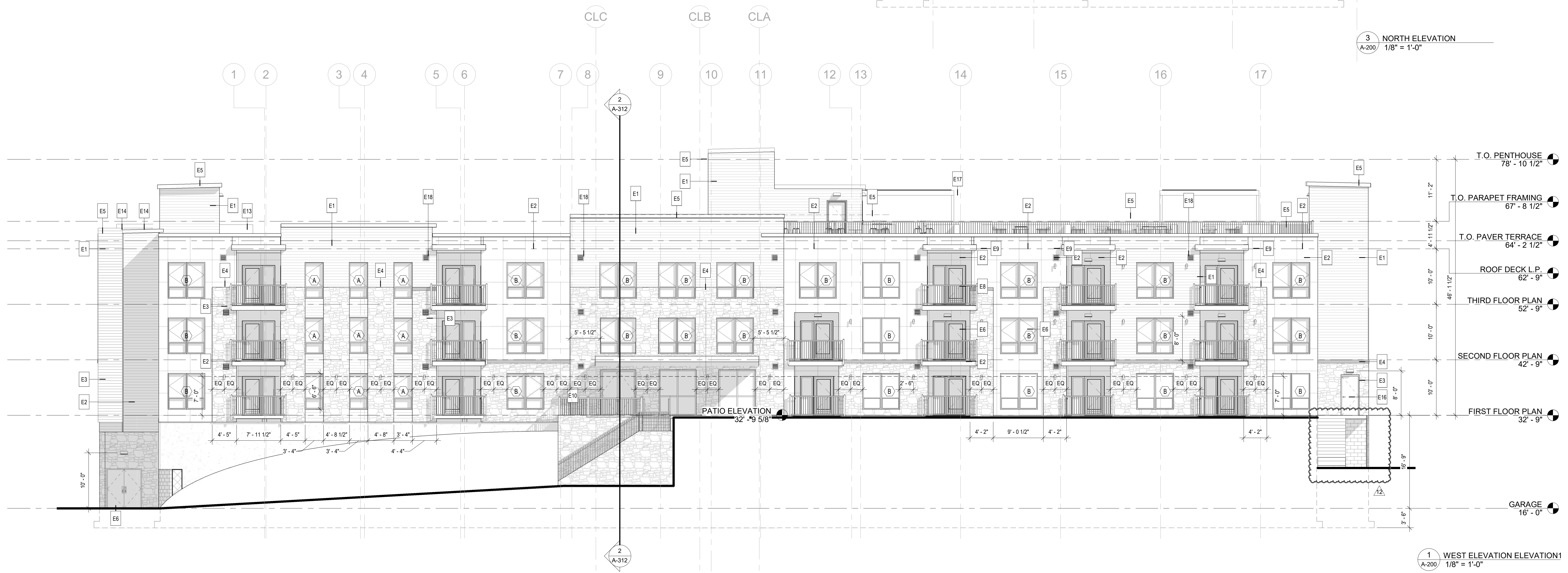
1 WEST ELEVATION ELEVATION A-200 1/8" = 1'-0"