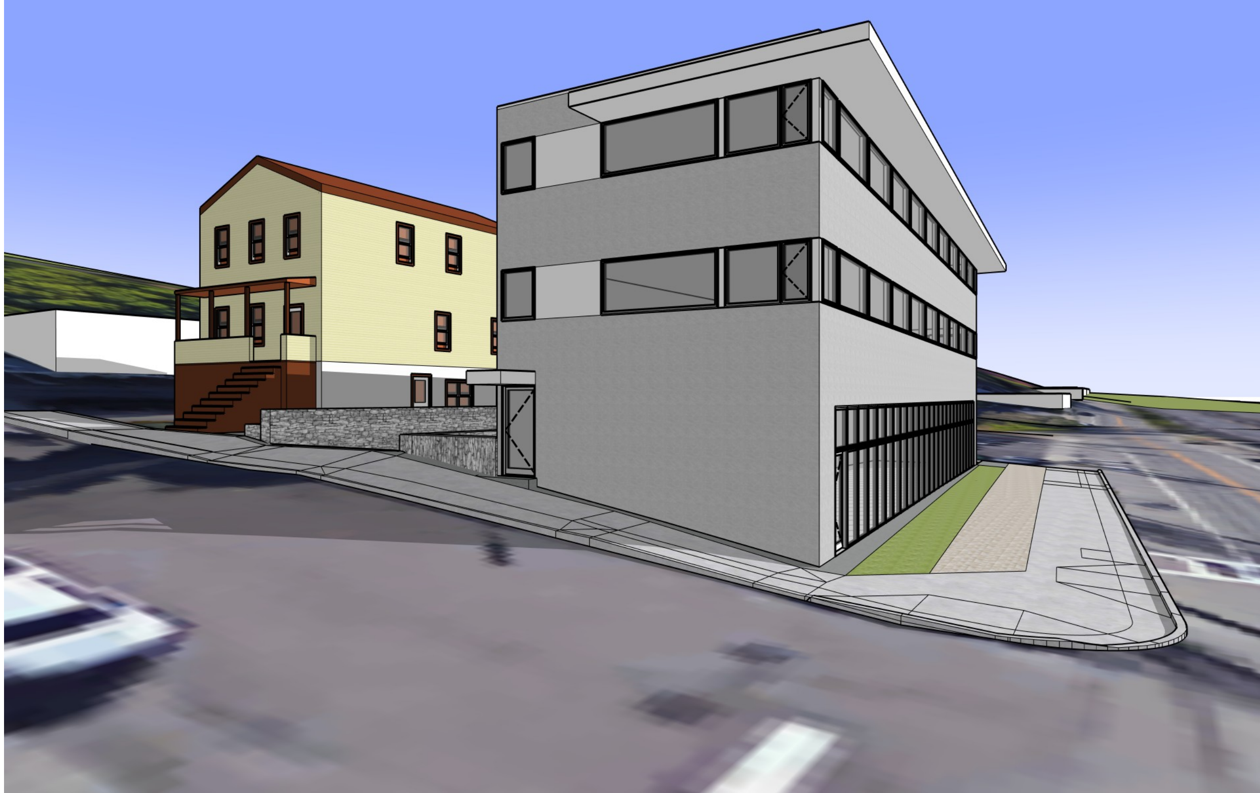
01 NORTHWEST VIEW FROM THE CORNER OF BANK STREET AND NORTH RIVERSIDE AVE N.T.S.