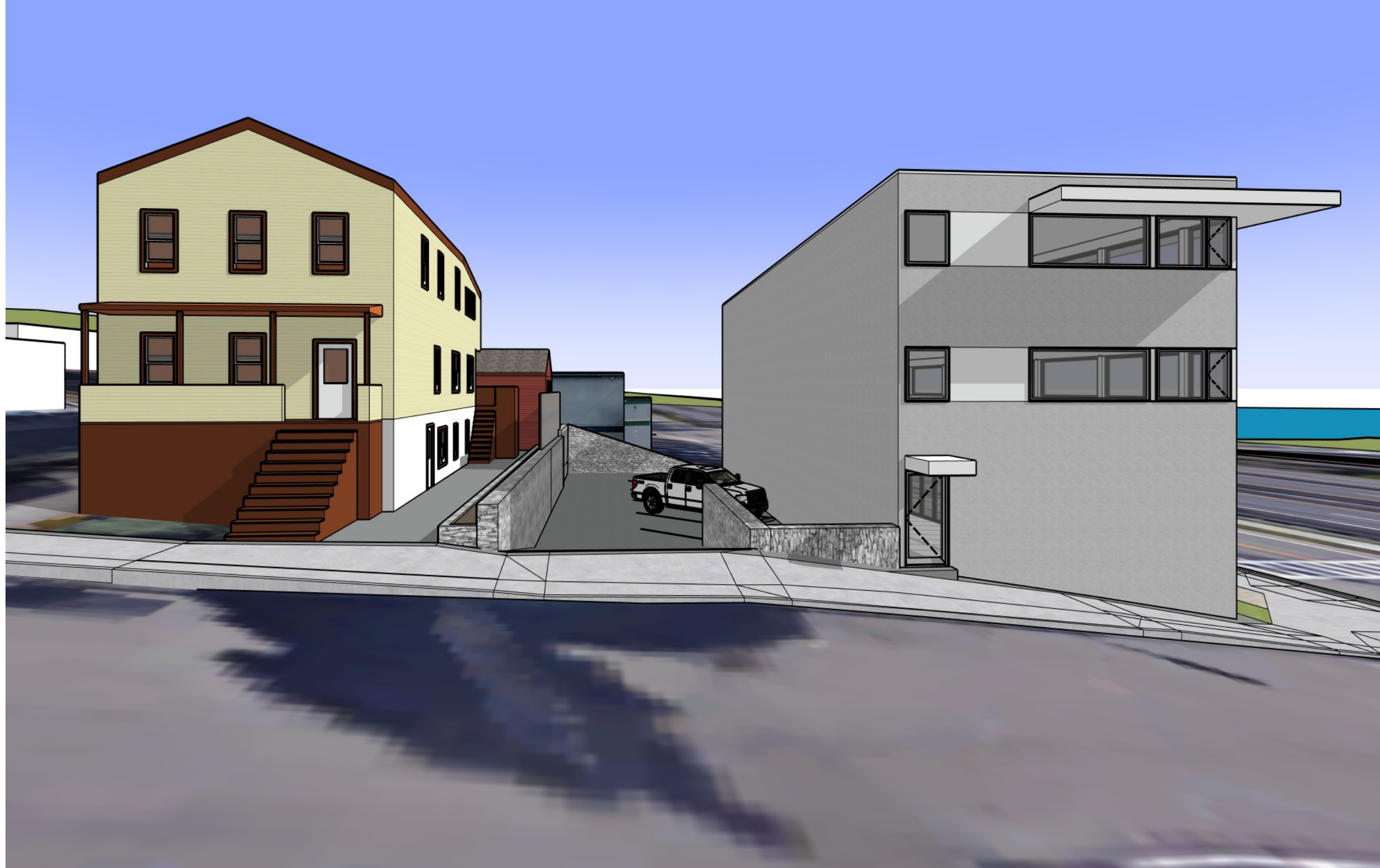
01 NORTH ELEVATION VIEW FROM BANK STREET N.T.S.