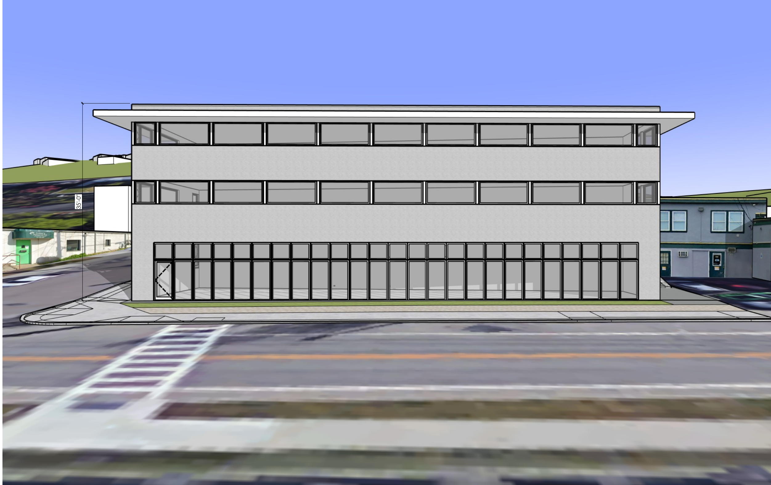
01 WEST ELEVATION VIEW FROM NORTH RIVERSIDE AVE N.T.S.