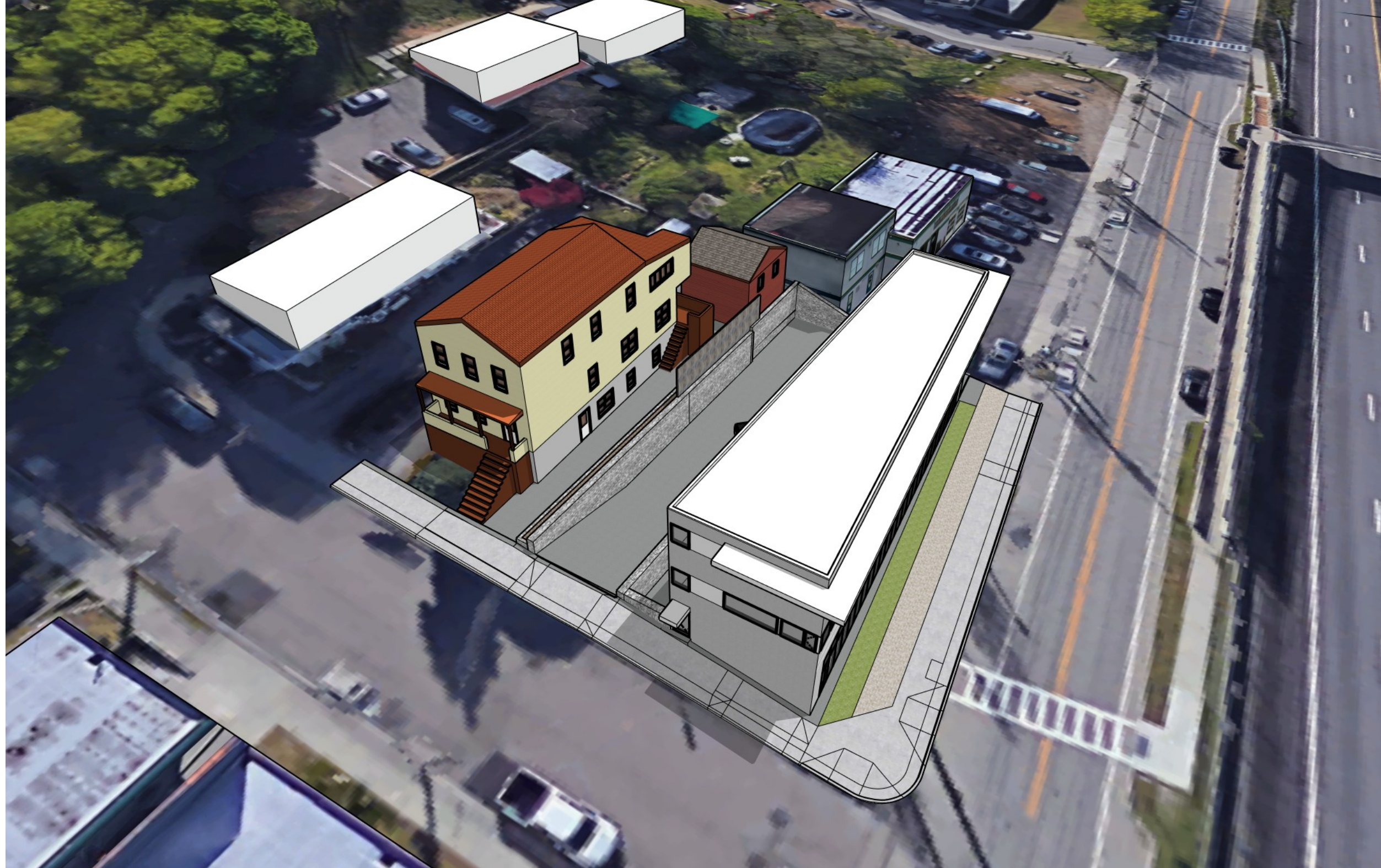
01 THREE-STORY BUILDING (35' MAX. HEIGHT PER ZONING) N.T.S.