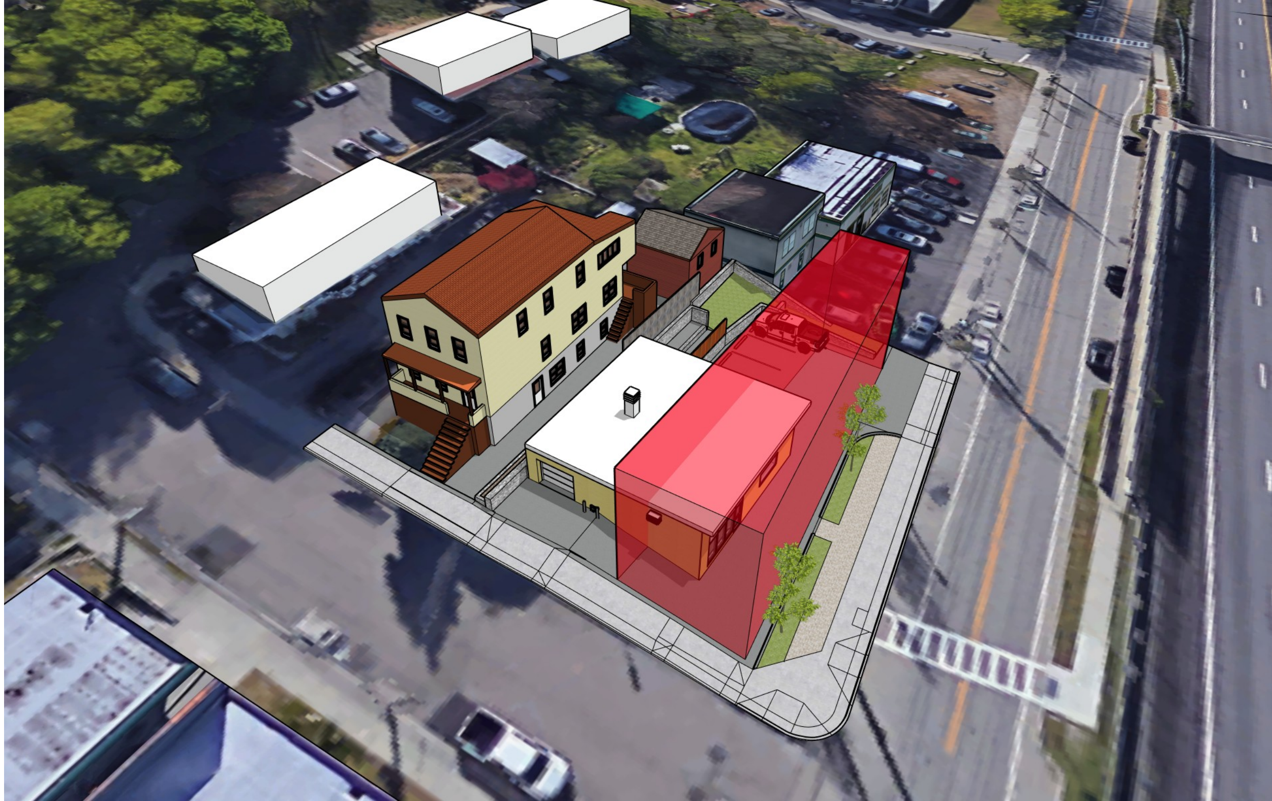
01 AERIAL VIEW OF EXISTING BUILDING AND BUILDABLE VOLUME (35' MAX. HEIGHT PER ZONING) N.T.S.