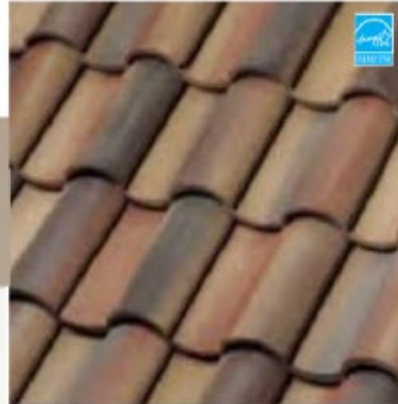
Boral Roof Tile: Pinto Blend