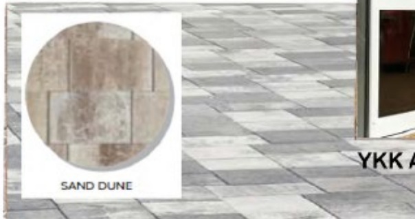
Tremron: Ultra Combo Sand Dune