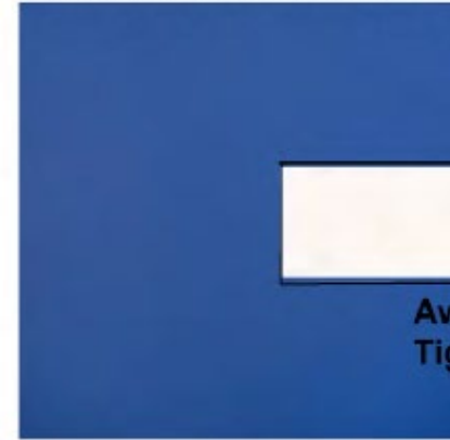
Awnings: Capriccio Mediterranean