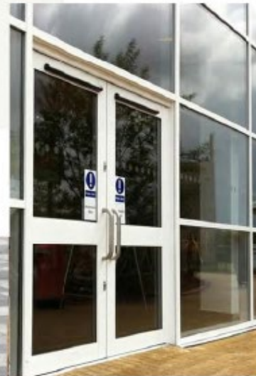
YKK Aluminum Windows Bone White