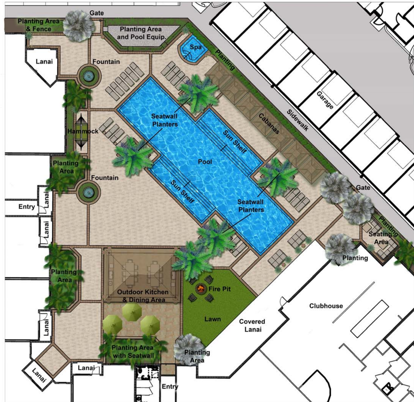
COCONUT POINTE RESIDENCES at THE BROOKS Pool Amenity Area