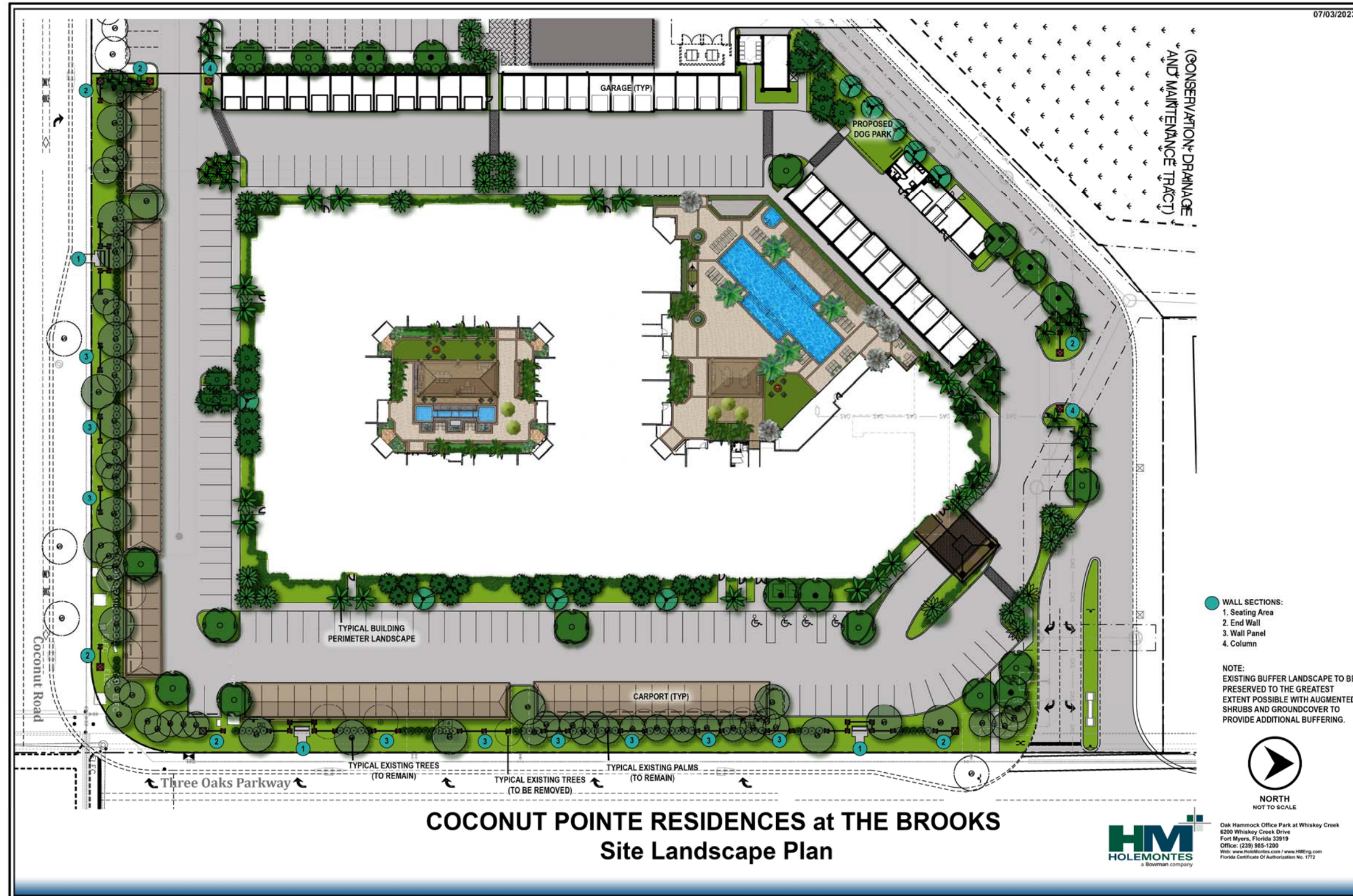
COCONUT POINTE RESIDENCES at THE BROOKS Site Landscape Plan