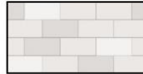
EFS-06: LARGE FORMAT STONE LOOK EXTERIOR INSULATING FINISH SYSTEM COLOR: OFF WHITE (VARIED)