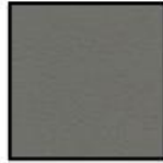
EFS-04: EXTERIOR INSULATING FINISH SYSTEM COLOR: DARK GRAY