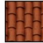
CBT-01: CEMENTITIOUS BARREL TILE ROOFING COLOR: ADOBE