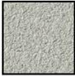
EFS-02: EXTERIOR INSULATING FINISH SYSTEM COLOR: WHITE ROUGH/HEAVY TEXTURE