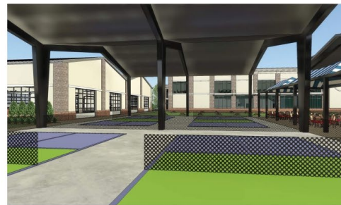
Looking South from Pickleball Courts