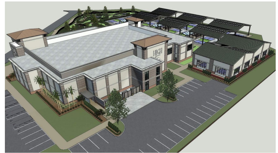
Aerial Perspective from Southeast