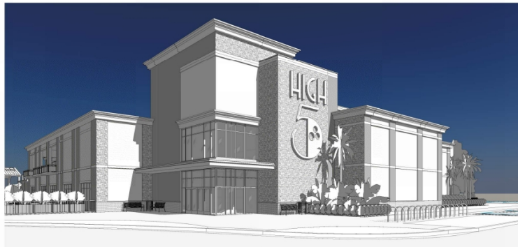
3 3D View from Southwest