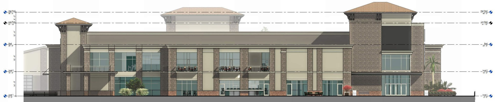
2 West Elevation 1/8" = 1'-0"