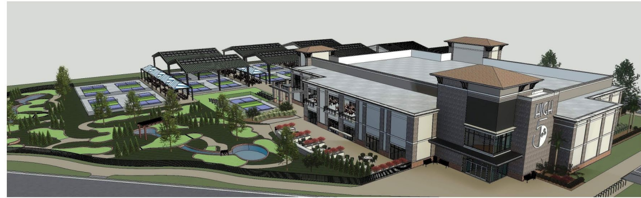
Aerial Perspective from Southwest