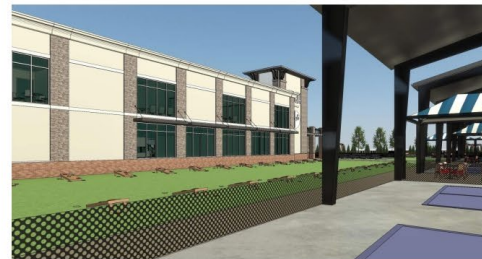
Looking West between High 5 and Pickleball