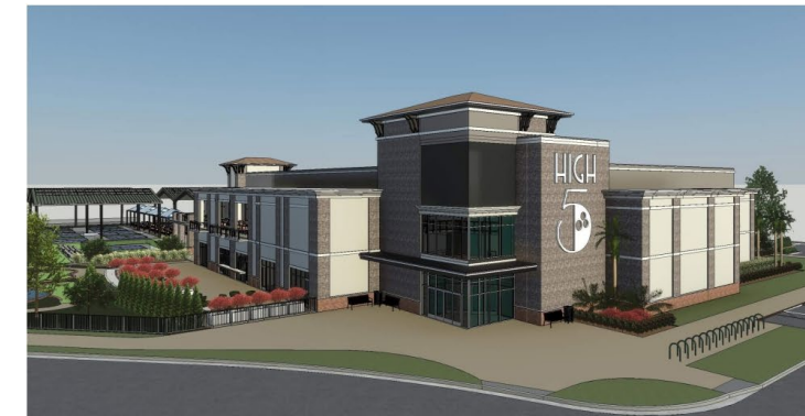
Perspective from Southwest