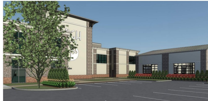
Perspective from South (Approach to Pickleball)