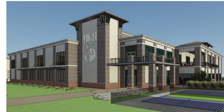
Perspective from Northwest