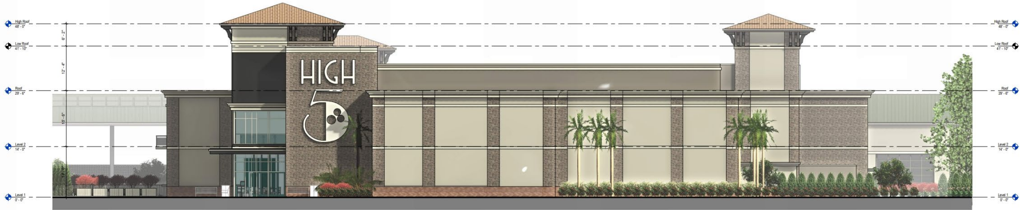
1 South Elevation 1/8" = 1'-0"