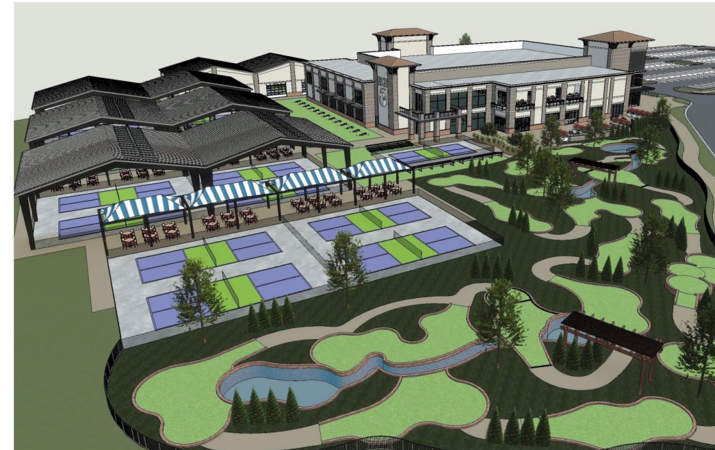
Aerial Perspective from Northeast