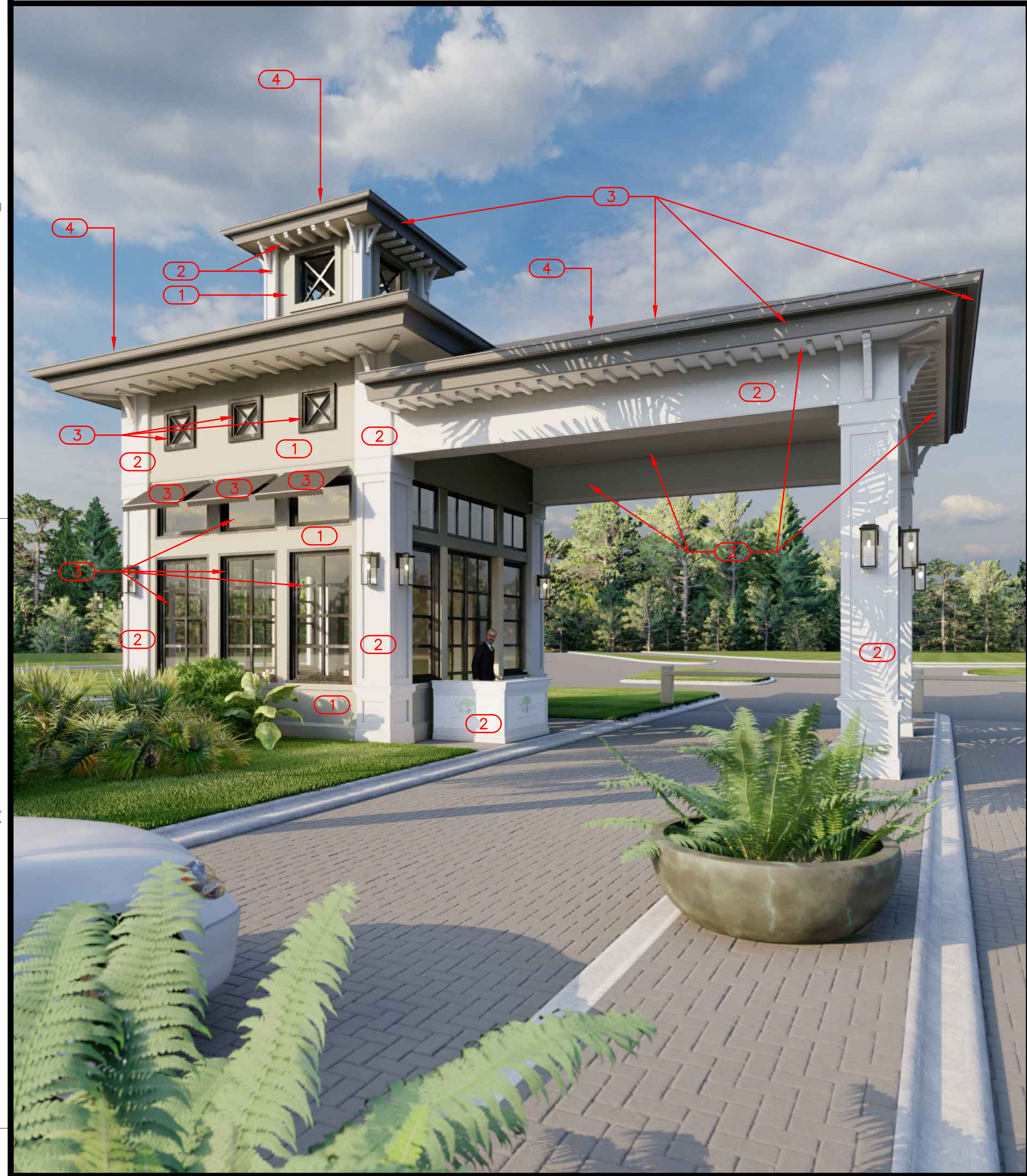
EXTERIOR COLOR OPTION 1 COLOR OPTION APPROVED ON 5/16/24 UNDER LDO 2024-E008