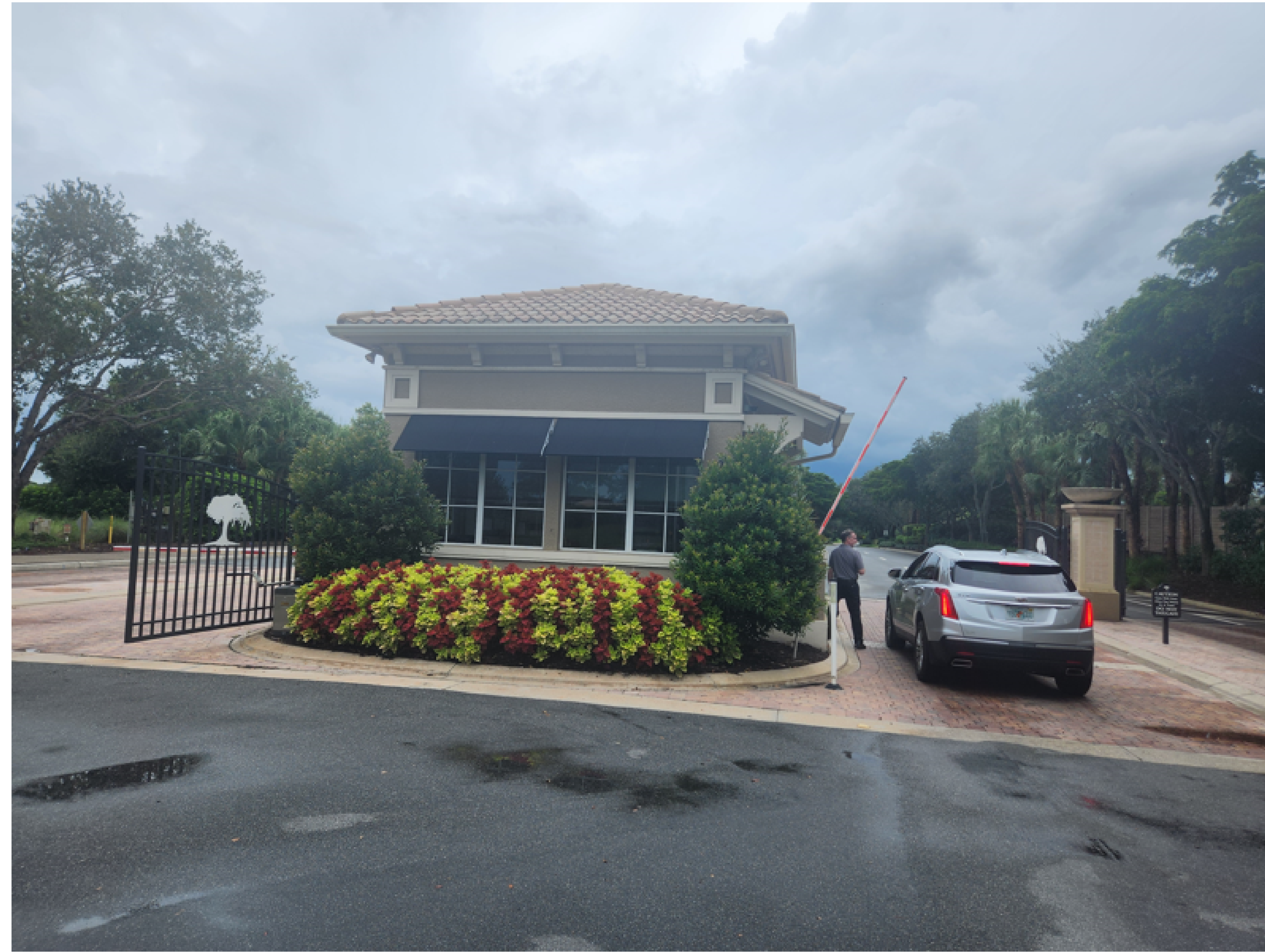
EXISTING PHOTO (LOOKING FROM THREE OAKS)