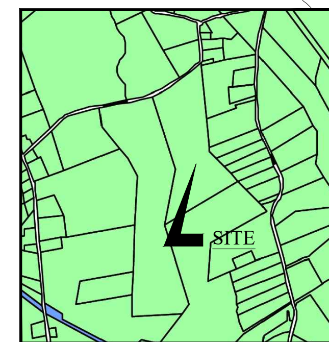
ZONING MAP N.T.S.