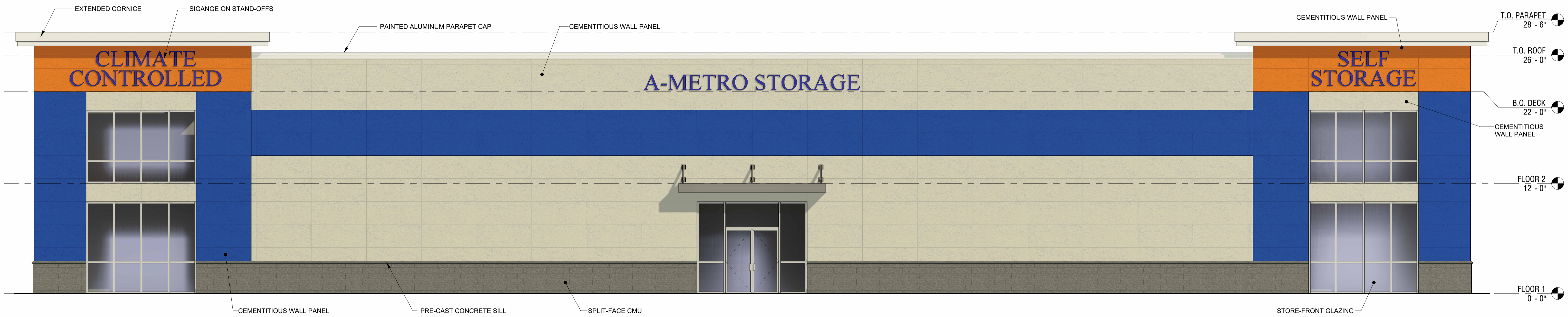
1 PROPOSED ELEVATION - WESTERN AVENUE A1 3/16" = 1'-0"