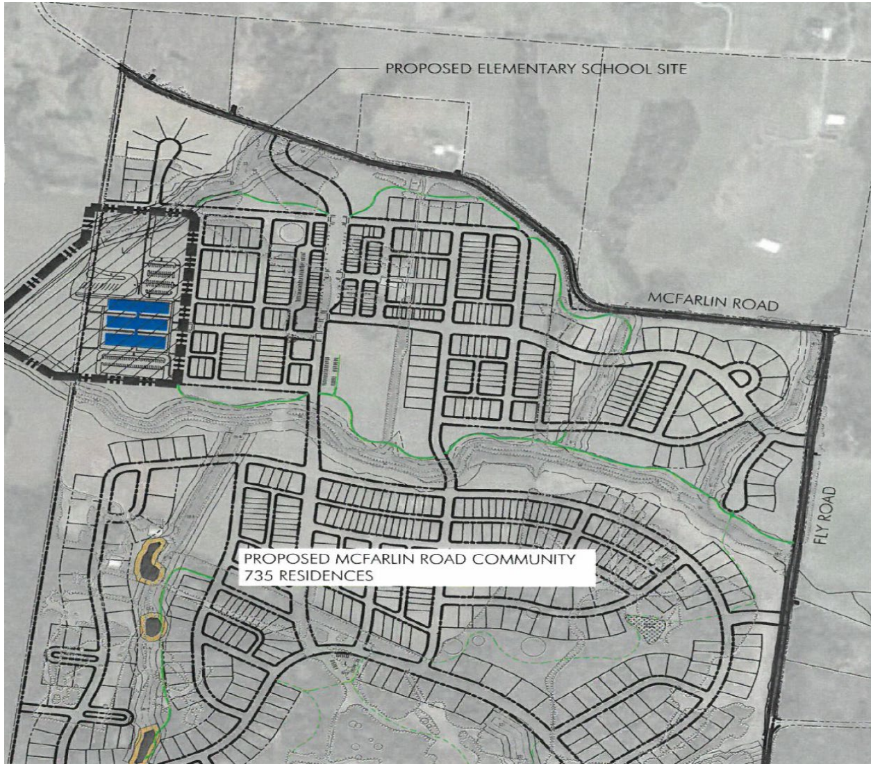
Exhibit C-1 Proposed School Site