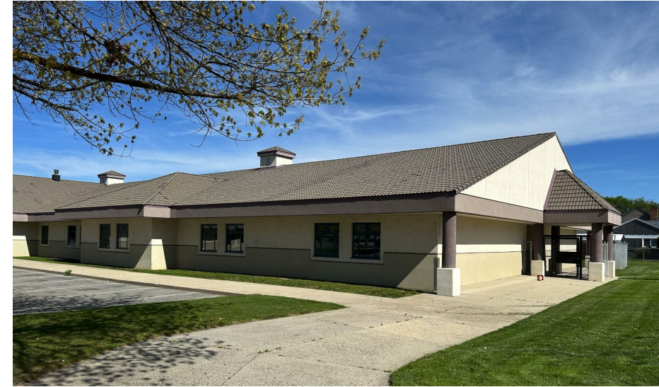
Columbia West Wing