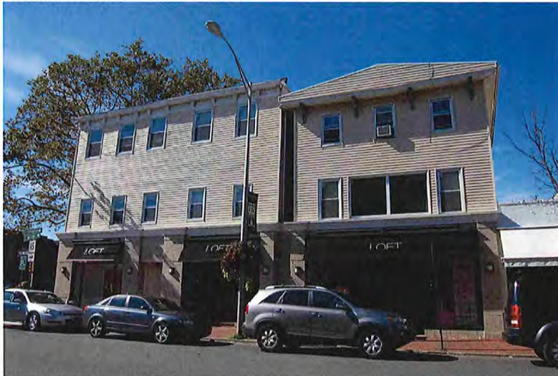
View of the east elevations.

TOWN NO.: _____ SITE NO.: _____ UTM: 18/____/____/____/____ QUAD: _____ DISTRICT: _____ NR: Actual Potential